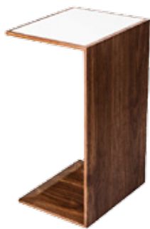
'Pirch' side table, $895, Rogerseller.