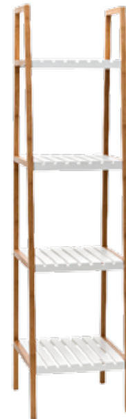
Bamboo 4-tier shelf, $35, Kmart.