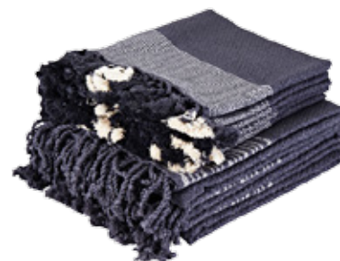
‘Truva’ hand towels in Charcoal, $29/each, and towels, $59/each, Atolyia.