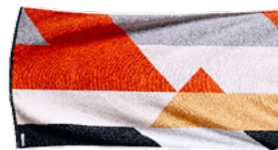
‘Spice’ bath towel, $79.95/each, Sunday Minx. Stockists, page 220