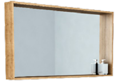
Omvivo ‘Venice’ box-frame mirror in Arlington Oak, $1199, Reece.