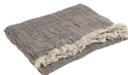
‘Flocca’ linen bath towel in Tempest Waffle, $155/each, Hale Mercantile Co.