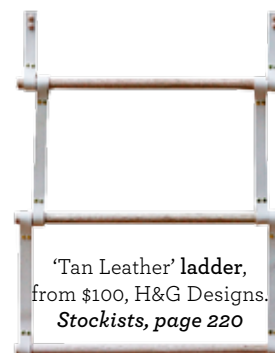
'Tan Leather' ladder, from $100, H&G Designs. Stockists, page 220