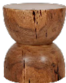
'Bandini' round stool in Natural, $379, Oz Design Furniture.