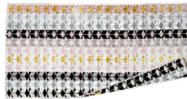
‘Fidelis’ bath towel, $99/each, Ziporah Lifestyle.