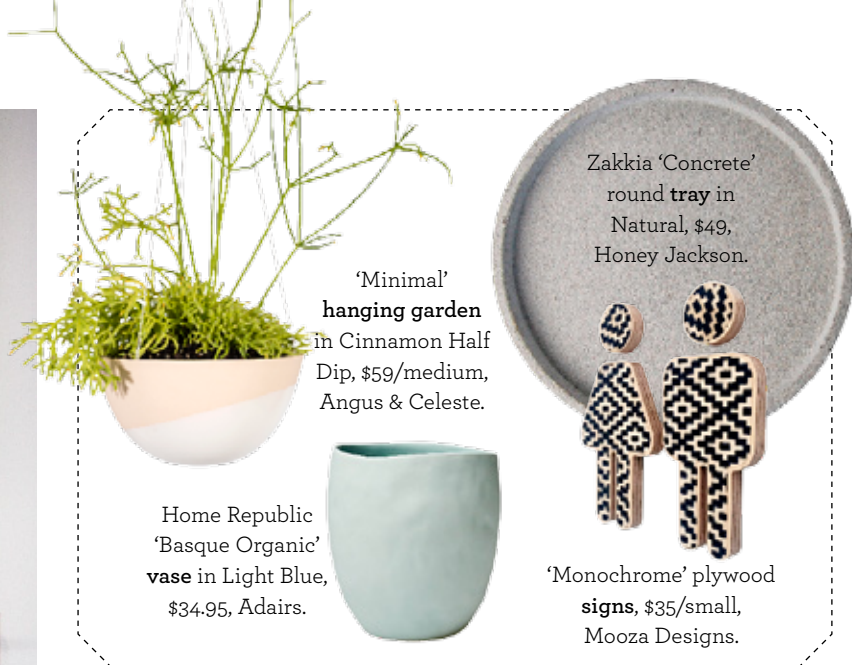
'Minimal' hanging garden in Cinnamon Half Dip, $59/medium, Angus & Celeste.