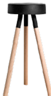
'Black Concrete' tripod stool, $250, Some Artists.