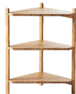
‘Ragrund’ bamboo corner shelf, $29.99, Ikea.